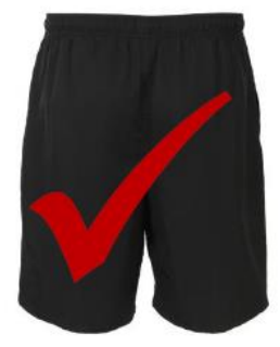
SHORTS CHWARAEON DU HOLLOL PLAEN - DIM PATRWM NA LOGOS PLAIN BLACK SPORT SHORTS - NO PATTERN/LOGOS