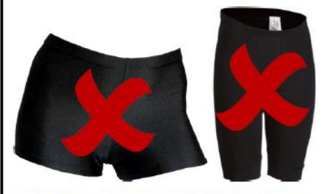
LYCRA TYNN GAN GYNNWYS SIORTS SEICLO TIGHT LYCRA INCLUDING CYCLING SHORTS