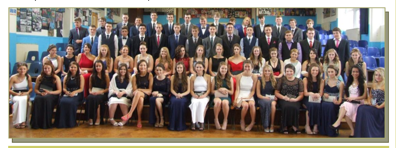
PROM 2015 Everybody looking very smart before leaving for Nant Gwrtheyrn

Year 11 were given a chance to relax after exams at the Prom held at Nant Gwrtheyrn. A very pleasant afternoon was had by all and the school awards were presented.