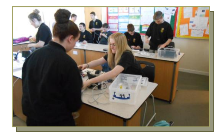
Computer Programming Workshops

An exciting new initiative launched by Congl Meinciau Enterprise Centre—for further information about hiring the kitchen pod contact the Enterprise Centre in Botwnnog