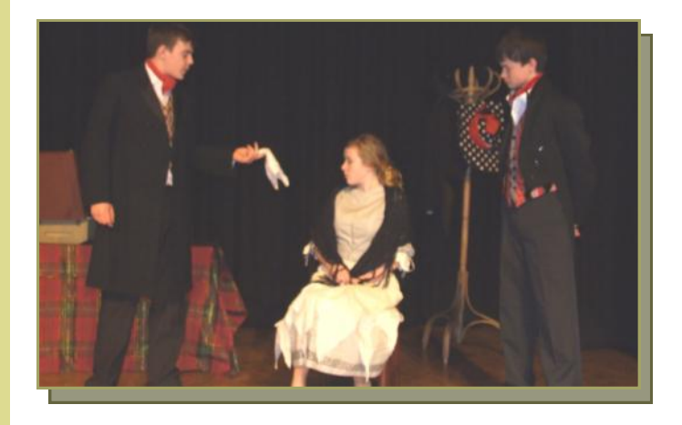
Yr 11 Drama Examination

It is important therefore, that pupils apply sunscreen when participating in any outdoor activities, on sports day etc.